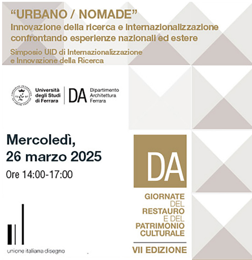
Fig. 1. Event poster.

project (North West Digital And Sustainable), an Innovation Ecosystem funded by the PNRR. The project integrates Digital Twin, BIM/GIS platforms, and open-access online models, emphasising the importance and potential of Virtual Reality for training, education, and natural risk management.