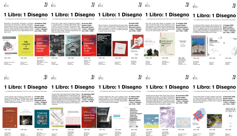
Fig. 2. 2. Composition of flyers of the initiative 1 Libro: 1 Disegno (graphic processing by Massimiliano Ciammaichella, graphic composition by Marta Faienza).