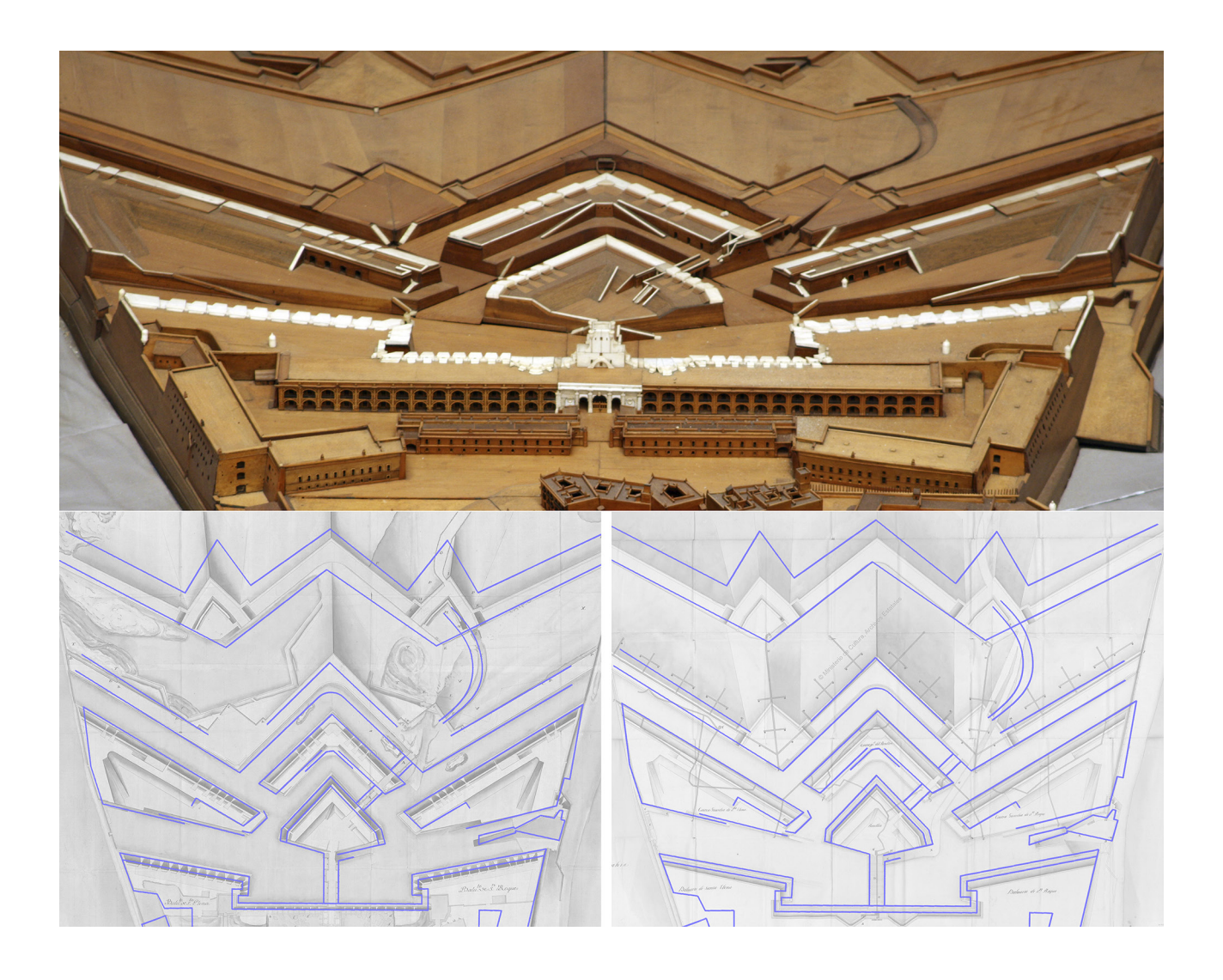
Fig. 7.Top: View of Puerta de Tierra (Land Gate) of the model of Cadiz (Museo de las Cortes de Cádiz). Bottom: Superimposition of the model survey (in blue) on the historical cartography of 1750 (left) and 1798 (right). Photo and graphic elaboration by the authors over AGS, MPD, 53, 034 and 57, 040.