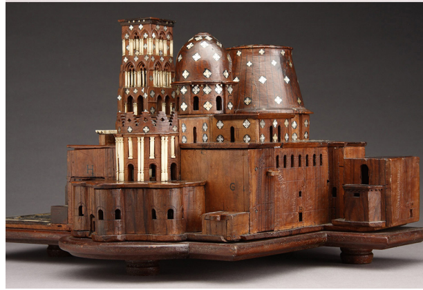
Fig. 12. Model of the Church of the Holy Sepulchre, Jerusalem. It is possible to disassemble it to access the interior where there are other parts. Finch & Co Gallery.

assembly that would include an explanatory book, a stairway to observe the model from an elevated point of view, binoculars to observe all the details from a distance, large banners and damask fabrics that hid the internal structure of the support [15].