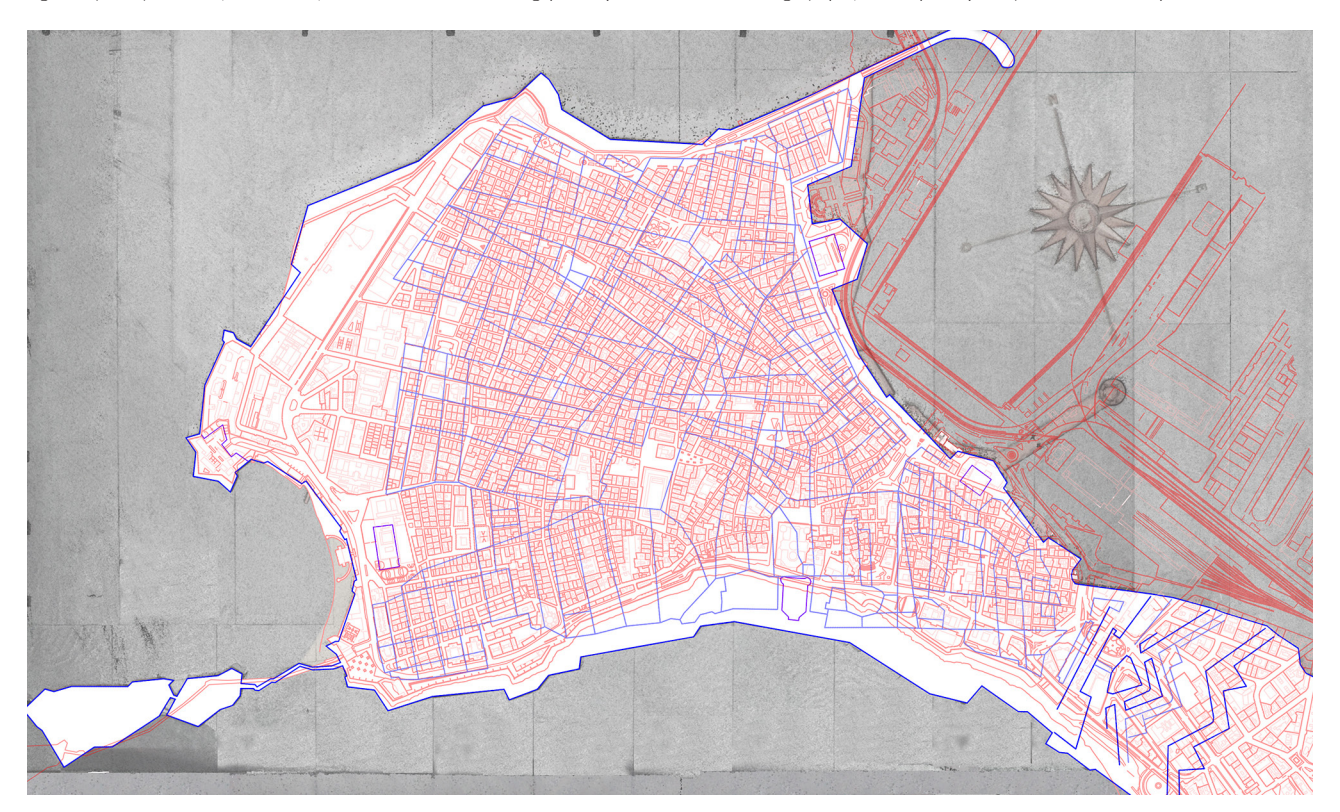
Fig. 6. Superimposition of the scan of the model and its drawing (in blue) on the current cartography of Cadiz (in red). Graphic elaboration by the authors.

Likewise, there is no documentary evidence that Ximénez used the existing military cartography of the city, whose production was especially prolific during the 18<sup>th</sup> century due to the different fortification projects that were planned and developed at that time [Chías Navarro, Abad Balboa 2011]. On the contrary, and although they could serve as a reference, the author made new surveys of the fortifications: (on the ground) "I have continued cutting an infinity of profiles, and elevations and where these have not been sufficient, I have proceeded to the copy of the ground in wax that increases the perfection I desire"; (in the workshop) "immediately from the Maestranza to direct the cabinetmakers; either drawing the figures on the wood, or adjusting myself their plans, and thicknesses; and in such delicate matters; and small, I do not pass them the