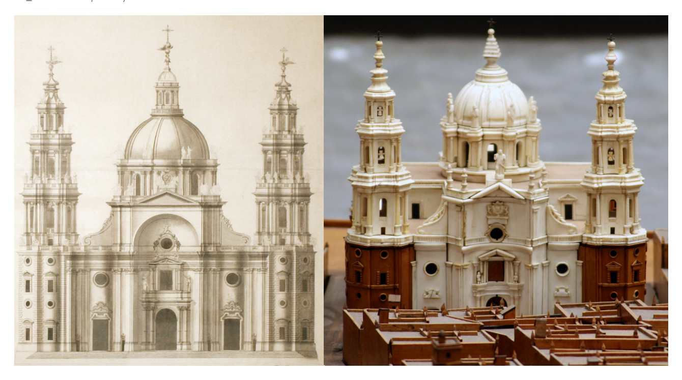
Fig. 8. Comparison between the 1775 project for the New Cathedral represented in the model of Cadiz (Museo de las Cortes de Cádiz). ETSAM Library, AG 0072-01 and photo by the authors.

the plan corresponds guite accurately with the current maritime border—especially in the western, northern and eastern fronts— and, on the contrary, there is a significant mismatch with the sea line in its southern front, where the Cathedral is located. Likewise, the city's urban layout is precise and corresponds to the current urban grid —with some exceptions and slight mismatches— in the space delimited by the aforementioned coincident fronts; the greatest errors occurring in the space adjacent to the Cathedral, as well as to the great fortification of Tierra -located to the southeast of the city—. In any case, and taking into consideration the magnitude of the model, we can conclude that Ximénez's representation is highly coincident with reality and, from our point of view, it is possible to attribute these discrepancies to the transformations produced in the model after his return to Cadiz; due to the rigor with which the author developed all his work, as we point out below.