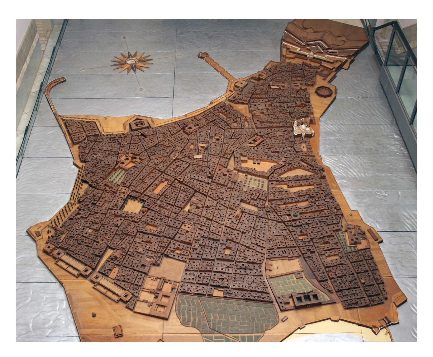
Fig. 3. General view of the model of Cadiz (Museo de las Cortes de Cádiz).