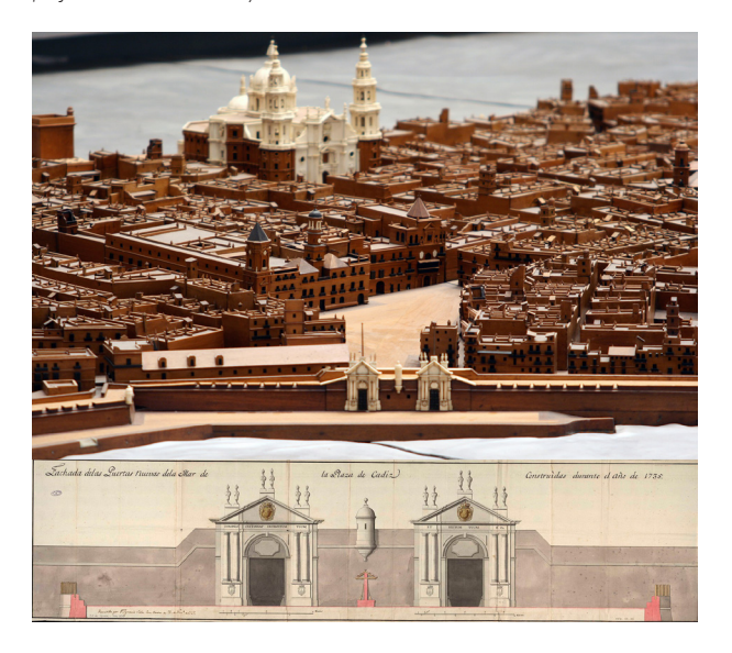
Fig. 4. View of the model of Cadiz (Museo de las Cortes de Cádiz) with the Puertas del Mar (Sea Gates) in the foreground, next to the plan of its project in 1736.

The work began in 1777 once Ximénez moved to Cadiz and selected the team of local masters -cabinetmakers, sculptors, measurement assistants, etc.—, although the project management considered the possibility of producing it directly in Madrid —the place where the model was to reside after its completion— and finally discarded it because of the higher economic cost [Martínez Montiel 1999]. This condition of mobility of the model was one of the most important and controversial factors when determining its scale, since initially the scale \pm 1:190 –"12 rods for every 3 fingers"— was considered and worked on, to finally adopt by agreement between Sabatini and Ximénez the scale ±1:250 - "7 rods per inch of Castile" - which would provide a smaller model [4]. In spite of this, the resulting model