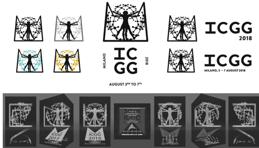
Fig. 1. Conference Logo: graphic version and rendered views of the crystall cube.

successful conferences at different venues around the world, the 19 th edition of the International Conference on Geometry and Graphics (ICGG 2020), which is promoted by the International Society for Geometry and Graphics (ISGG), will be held at the University of São Paulo (USP) on August 9-13, 2020. São Paulo is the largest city in South America and the most important economic and cultural center of Brazil. Home of the largest Arab, Italian, and Japanese diasporas, it is a cosmopolitan melting pot city that offers a variety of entertainment, cultural attractions and gastronomy, and also the main hub for the tourism spots of the country. Following the past successful conferences, in the forthcoming ICGG we will encourage the expansion of the scope to new, interdisciplinary researches and