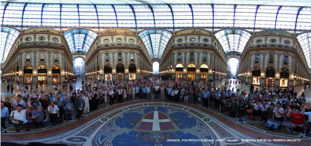
Fig. 3. Attendees meeting at the Great Dome of the "Vittorio Emanuele II Crystal Gallery" (Photo by Federico Brunetti).

active technical interchange and discussion on theoretical and applied, analogue and digital geometry and graphics and related fields between professionals, researchers, professors and students in architecture, engineering, industrial design, mathematics and arts. As an excellent opportunity to strengthen the tie with