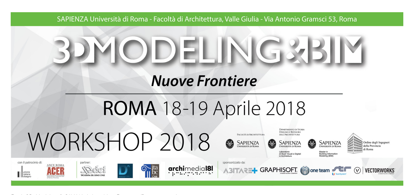
Fig. 1. 3D Modeling & BIM Workshop. New Frontiers. (Program cover).

favour of the digital and understood as an aid for the definition of new processes (effectiveness), appears increasingly marked (fig. 2).